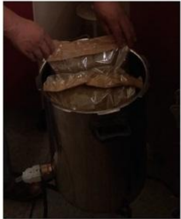
Steam treatment/Autoclaving of rumen digesta