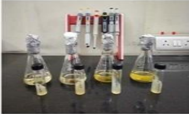
Dry matter estimation