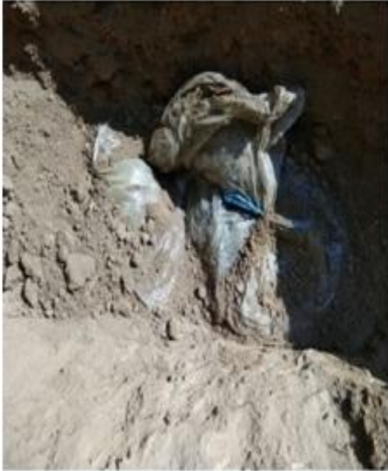
Ensiling of rumen digesta