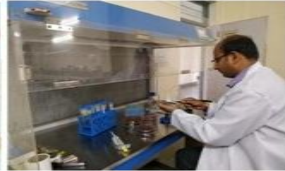
Microbial study of rumen digesta