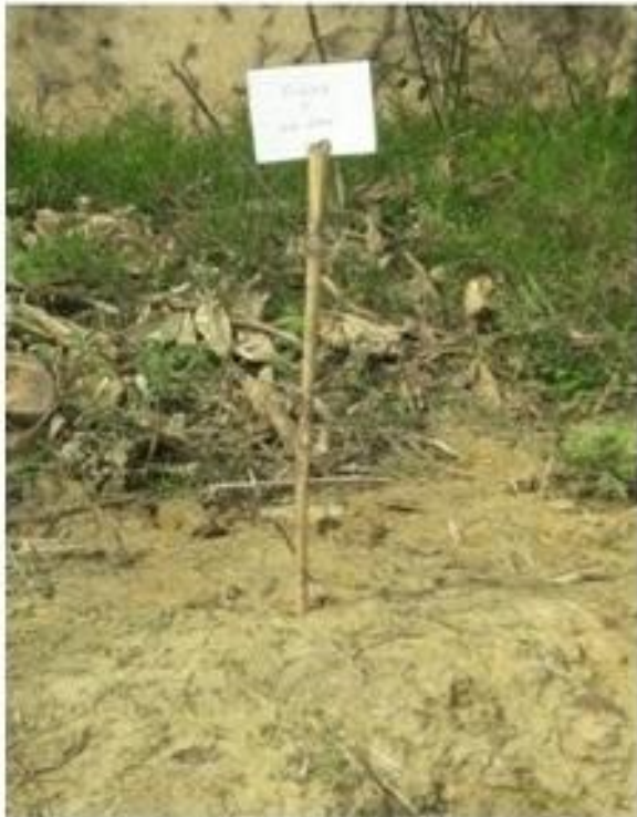
Ensiling plus sun-drying of rumen digesta