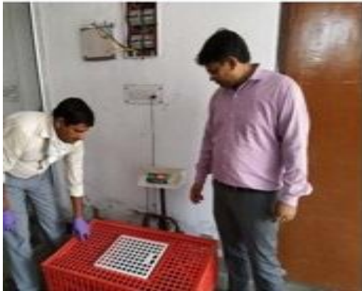
Poultry feeding research trial