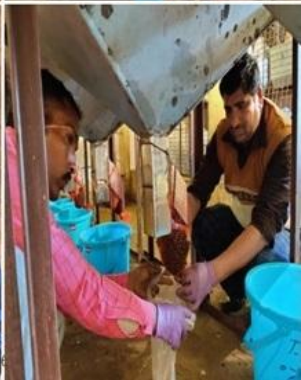
Metabolic trial in Goat