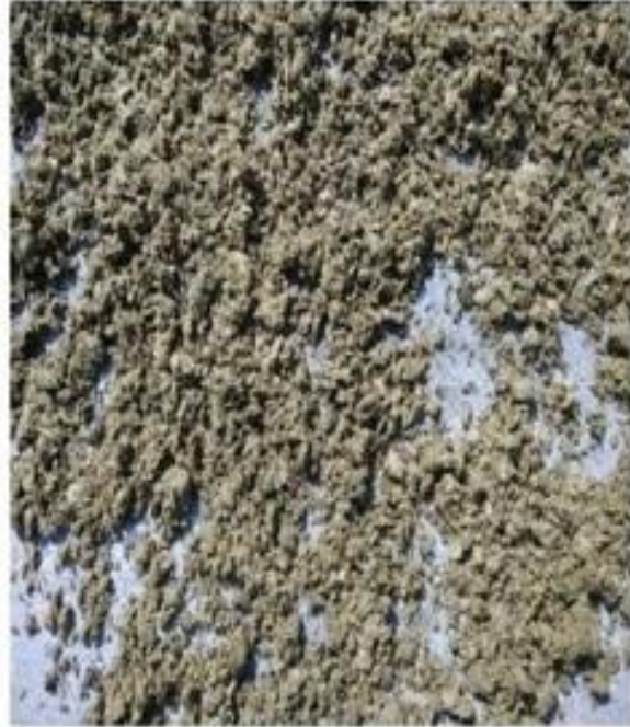
Sun drying of rumen digesta