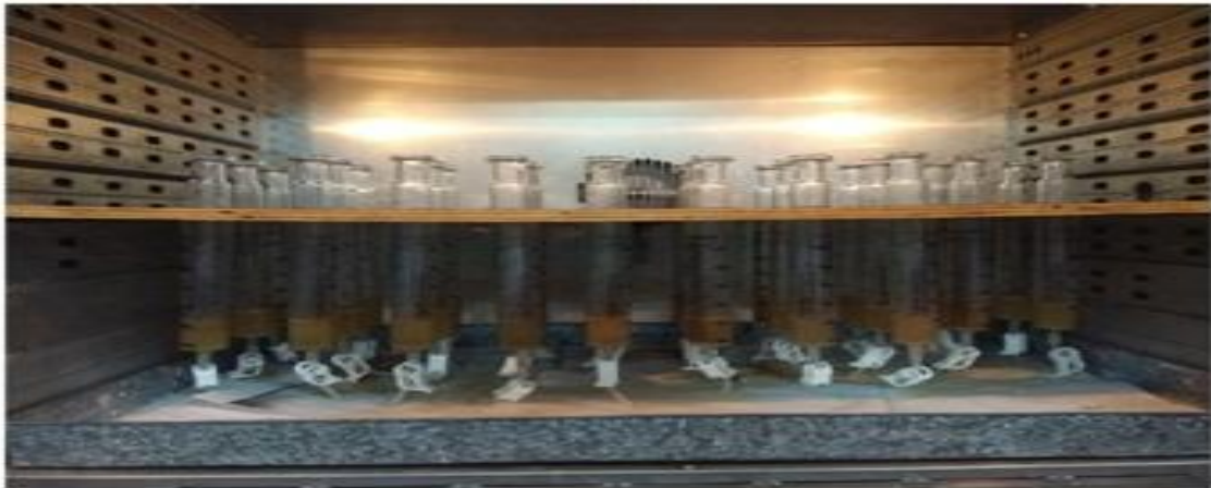
In Vitro study for rumen digesta