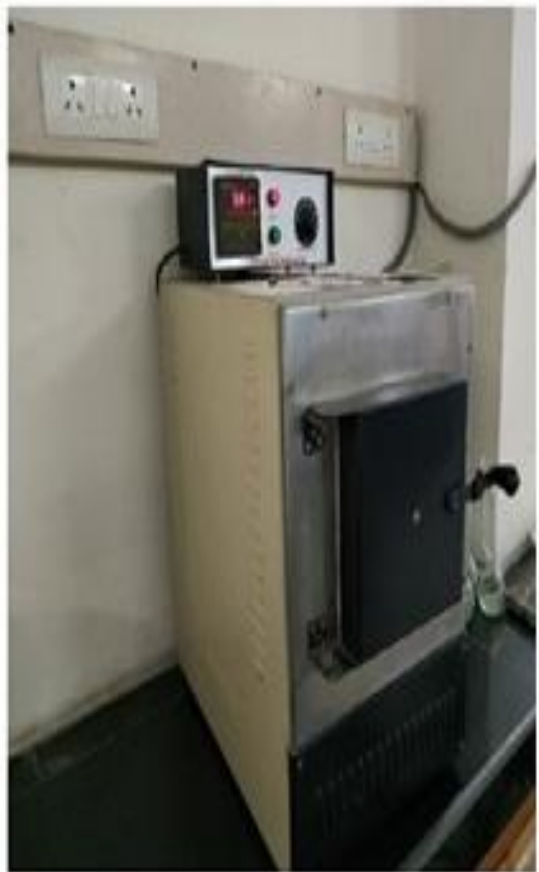
Total ash estimation