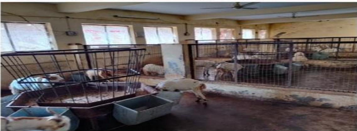
Goat Individual feeding trial