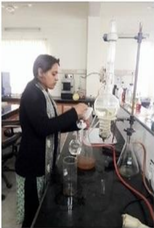
Crude fibre estimation